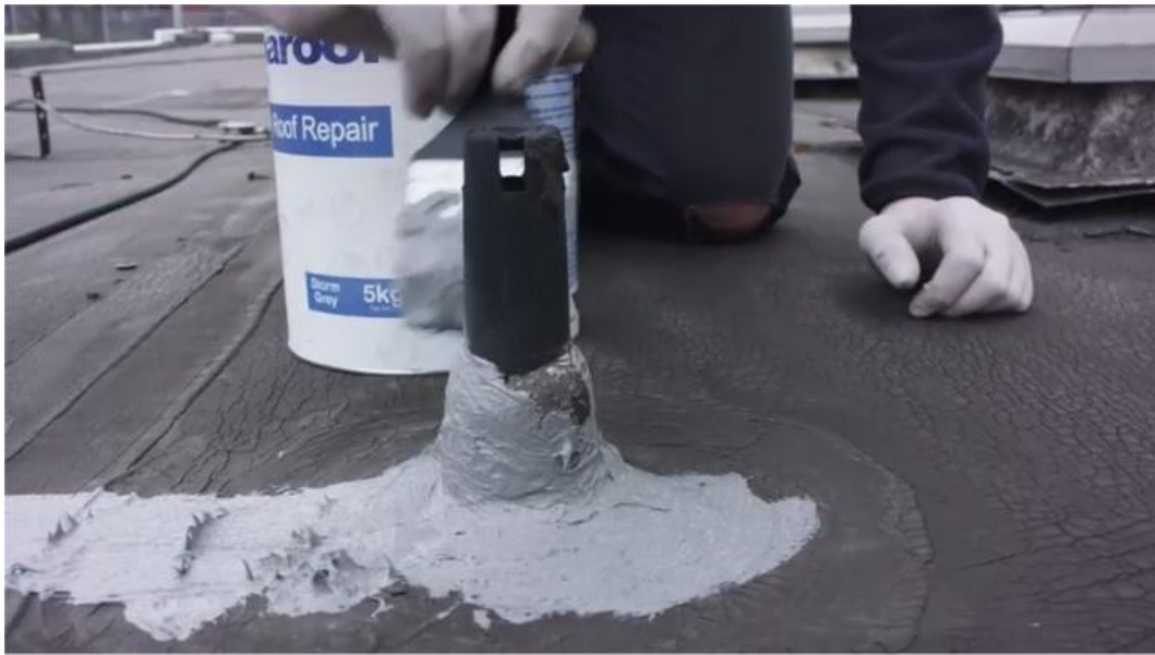
Fig 7 - Applying the product around a pipe extrusion.

Apply the product around any extrusions in the damaged area to ensure a completely watertight seal.