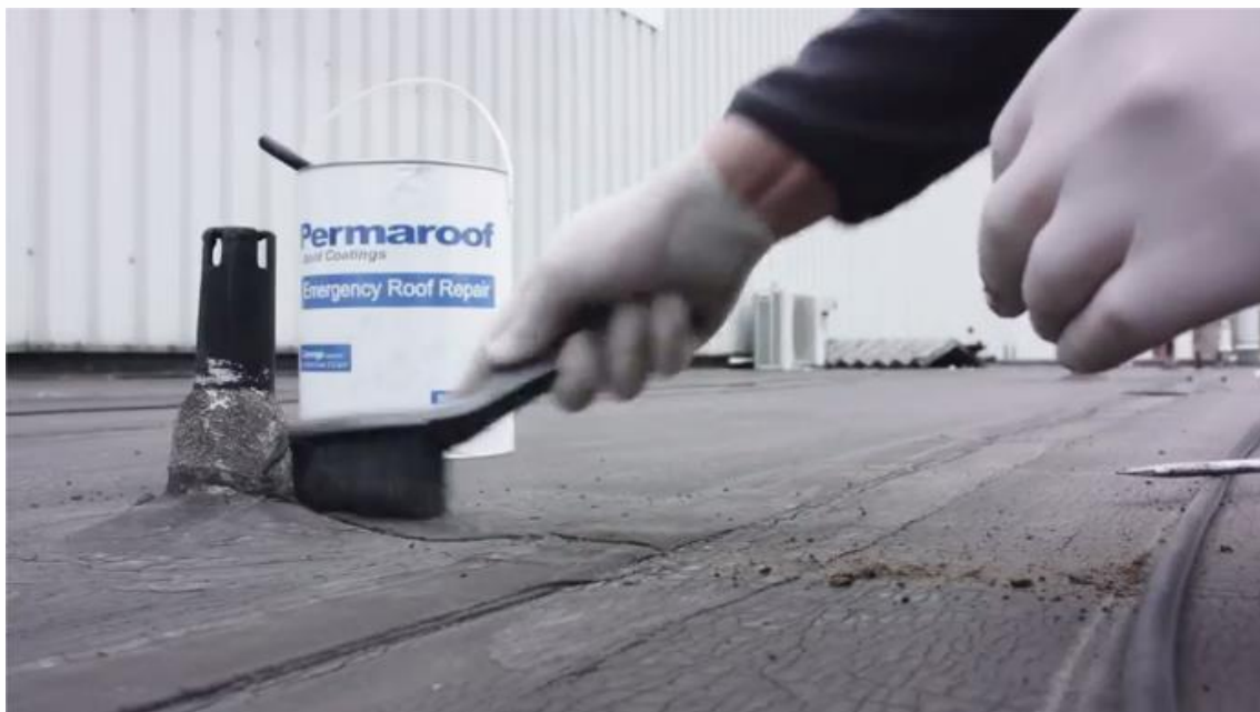
Fig 3 - Brushing away loose debris to complete preparation of the area.

Once the surface is completely clear of debris and dust, you are now ready to apply the Permaroof Emergency Roof Repair.