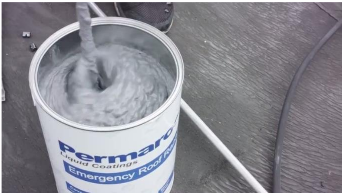
Fig 1 - Thoroughly mixing the Permaroof Emergency Roof Repair product.

Remove the lid from the Permaroof Emergency Roof Repair product and mix thoroughly for several minutes, or until the product is fully blended.