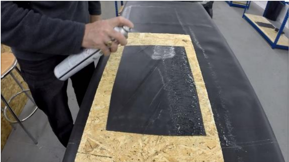
Fig 5: Applying spray bonding adhesive to the underside.

Apply bonding adhesive to the membrane underside, and to the roof substrate.