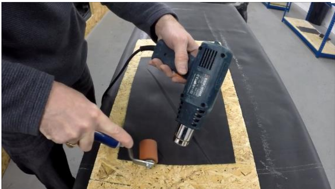
Fig 3: Working quickly and evenly across the membrane.

Work quickly and efficiently across the creased area without remaining in one place for too long.