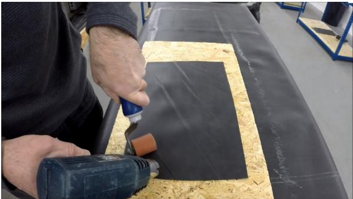
Fig 4: Applying gentle, firm and consistent pressure to iron out the creases.

Apply gentle, yet firm and consistent pressure to the roller to remove the creases.