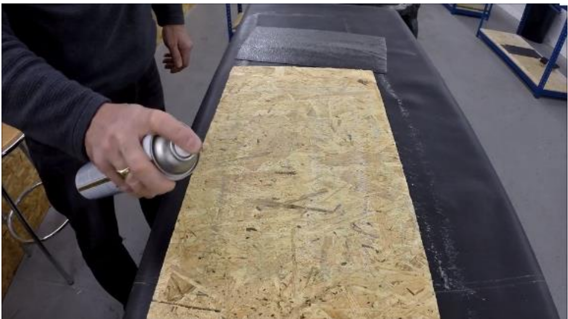
Fig 6: And to the roof substrate.