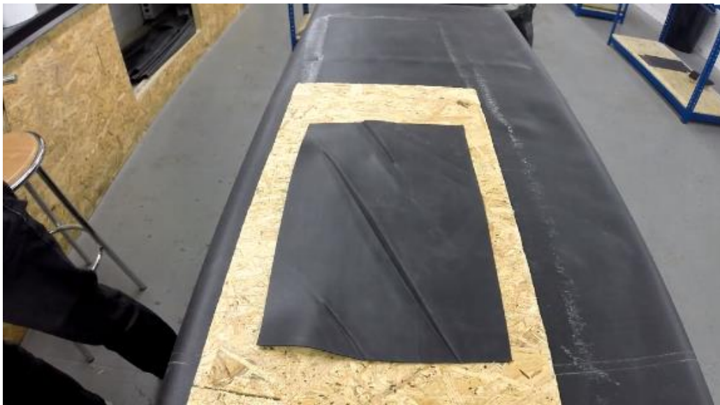
Fig 1: Laying out the creased EPDM membrane.

Lay out the creased EPDM membrane and smooth onto a flat working surface.