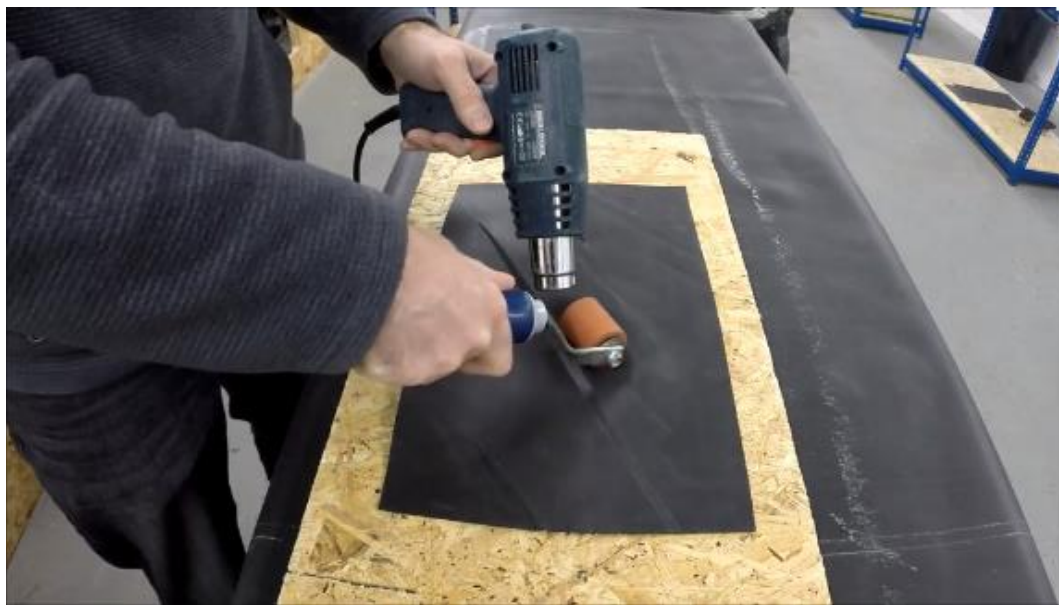
Fig 2: Heating the EPDM membrane and smoothing with the silicon roller.

Using a heat gun, gently heat up the surface of the EPDM membrane and smooth out the creases using a silicon roller.